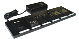
6-way pager charging bank