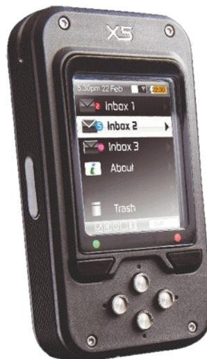
X5 Digital Radio Pager