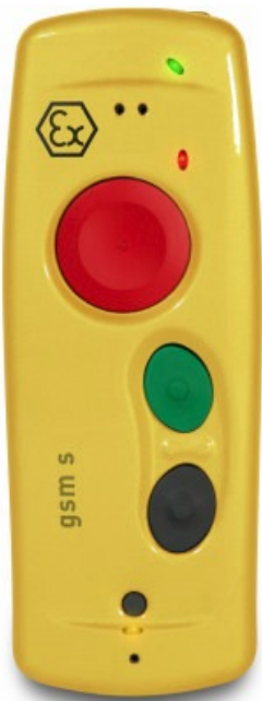
GSM-s AtEx lone-worker (man-down) personal device.