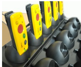
15-way charging bank